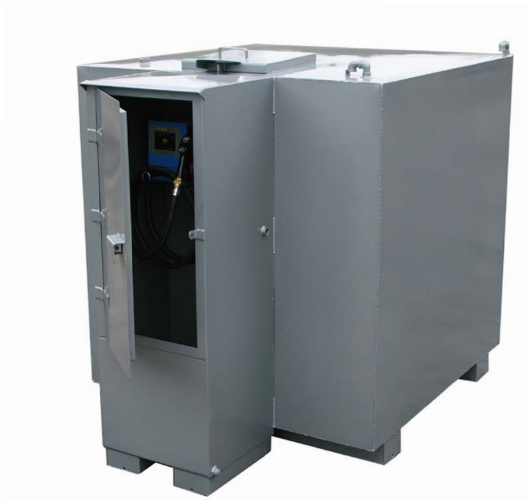
EFS 5000 BUNDED WITH SECURITY CABINET